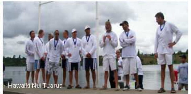
Hawaiki Nui Tuarua