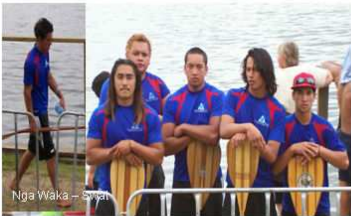
Nga Waka - Swai