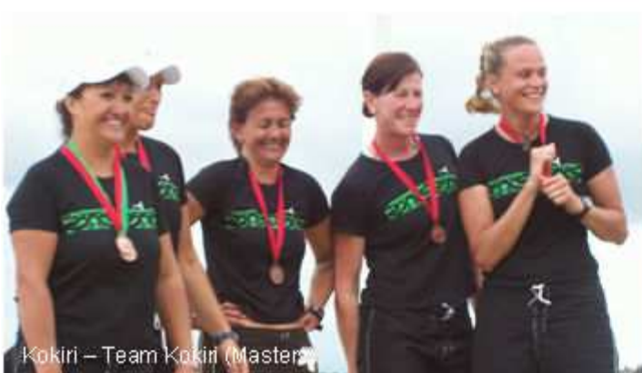
Kokiri - Team Kokiri (Masters)