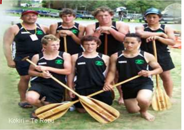
Kokiri - Te Rogu