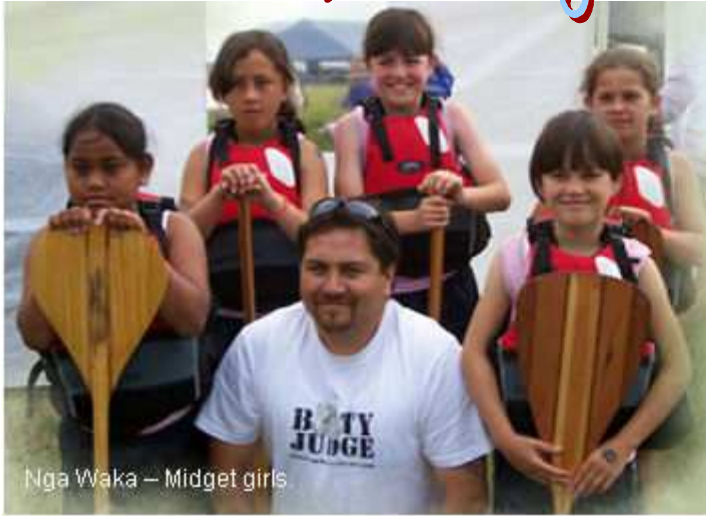
Nga Waka - Midget girls