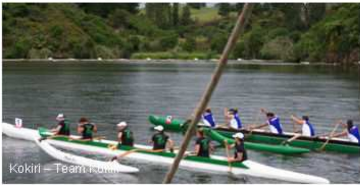
Kokiri - Team Kōwhiri