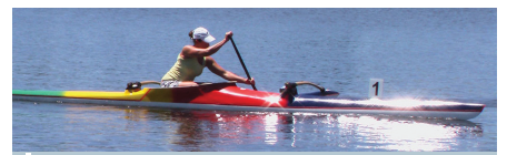
Wearing her water resistant hearing aid

"It is amazing to be able to pass the calls onto another paddler in absolute confidence that I will be able to hear all calls and commands of my team mates"