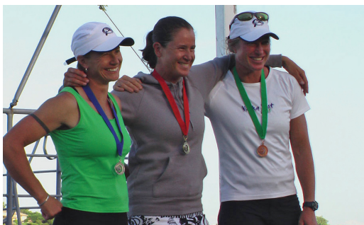
Winning the Waka Ama Gold Medal